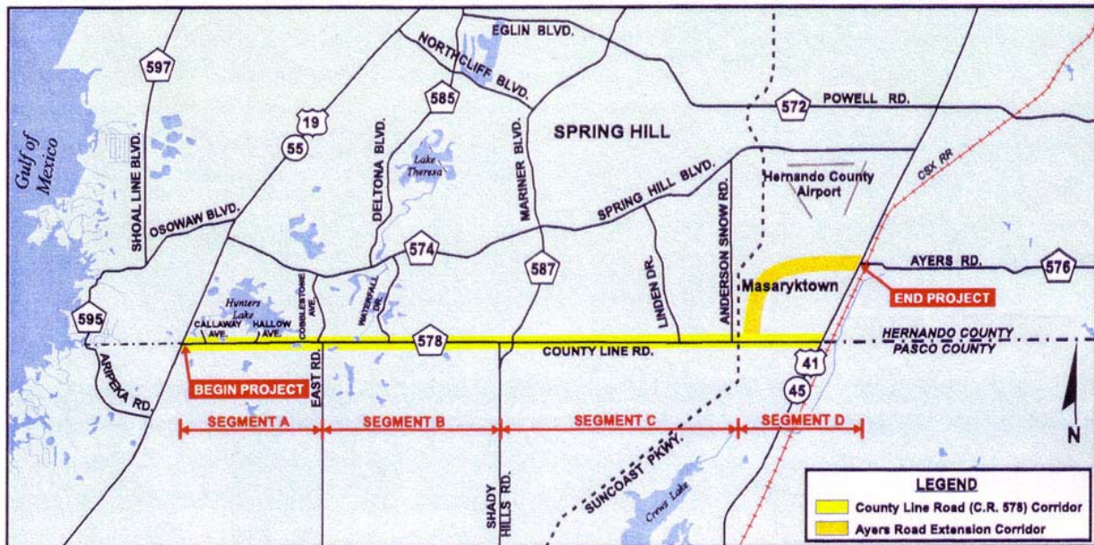
Figure 1: Project Location Map

The portion of the project involving the site includes construction of a segment of new roadway, referred to as the Ayers Road Extension. This portion of the project is approximately 3.5 mi (6 km) in length.